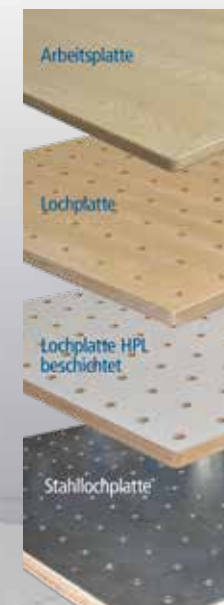
For worktops, refer to page 13