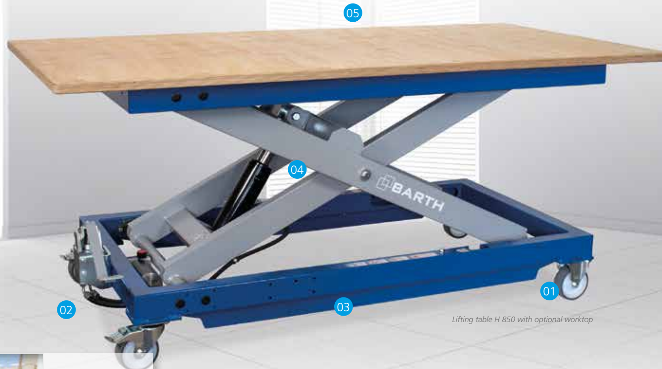
Lifting table H 850 with optional worktop

depending on the application, with optional extensions, with adjustable size